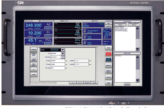
7RU ACU with 15 Inch Touch Screen

The Antenna Control Unit (ACU) is the primary control and monitor interface point for the entire system, featuring embedded processing and a friendly touch screen windowed interface.